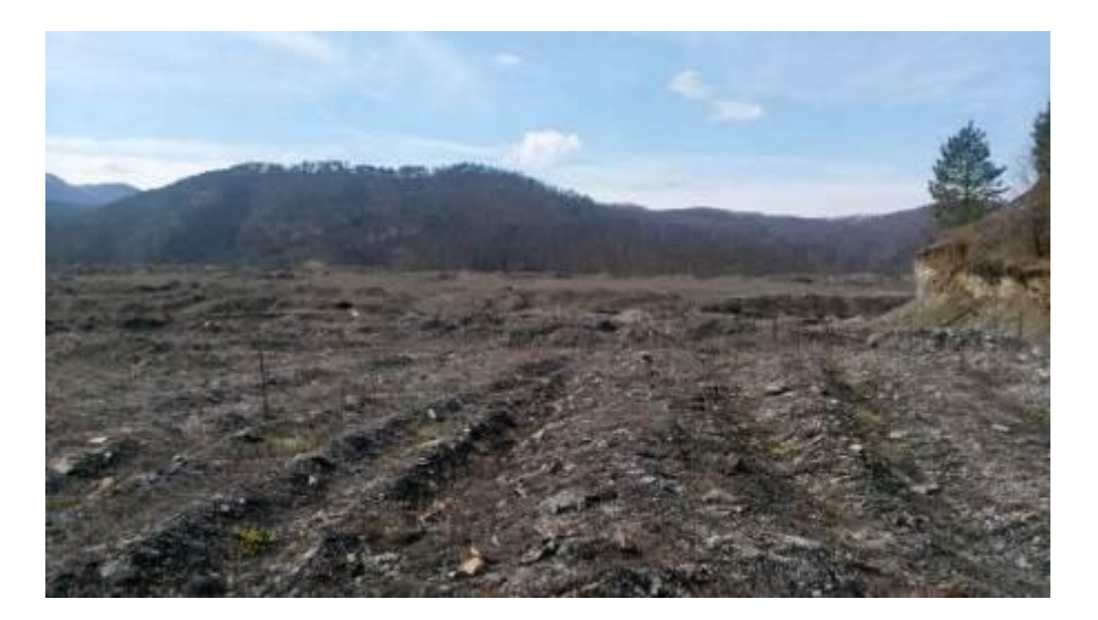
Figure 2: Current state of the LB at RSL site

The site had been used for many years as a disposal site for tailings from the local coal mine. The current state of the site is therefore modified and degraded (Figure 2).