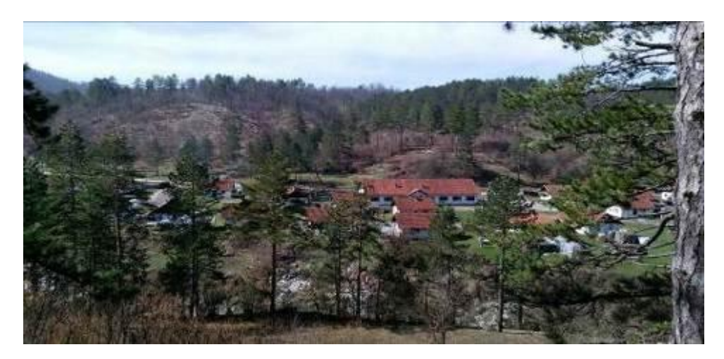
Figure 4: IDP settlement "Ježevac"