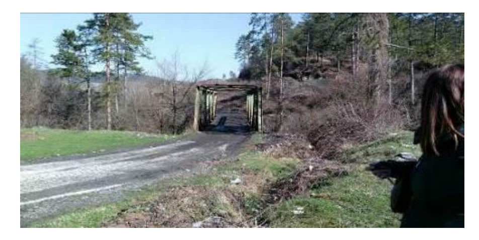
Figure 3: Access bridge to the location of the RSL over the "Oskova" River

The Oskova River flows at approx. 300 m west from the planned location of the landfill body. The bridge across the Oskova River (Figure 3) is planned to be reconstructed to enable access of heavy transport trucks to the landfill site.